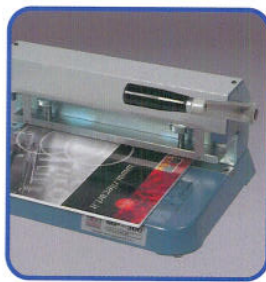
The MP-300 binding a book.