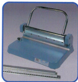
The MF-300 together with a punching tool.